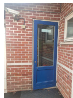
Nursery Right Side Door