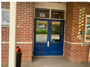
Door for Ducklings and Goslings (YR)

If for any reason your child is late, please take them to the school office reception area. You will need to sign them in using our electronic system and we will then take your child down to class.