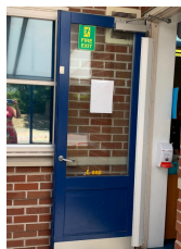
Door for Dragonflies (Y1)