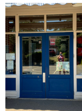
Door for Squirrels and Badgers (Y2)